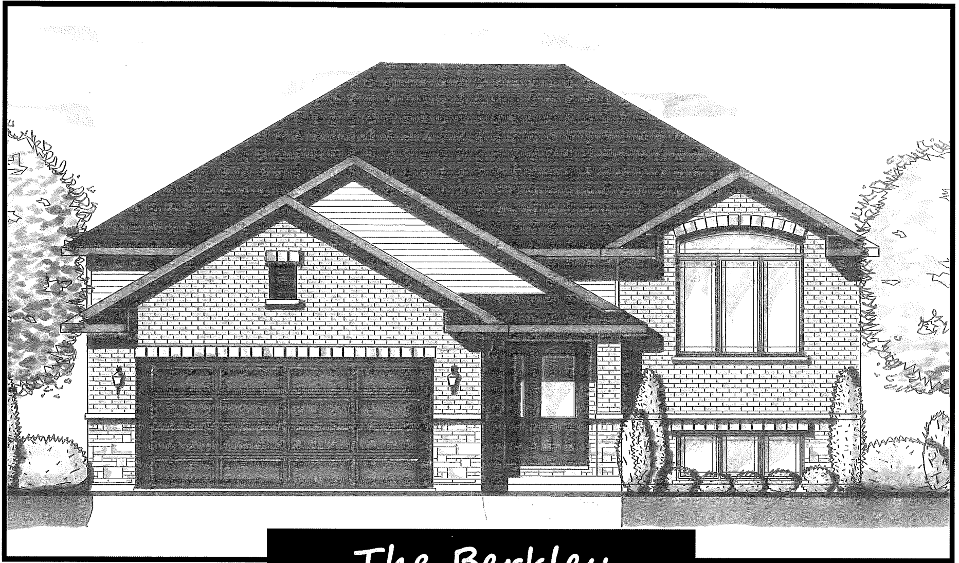
The Berkley 1511 sq. ft.